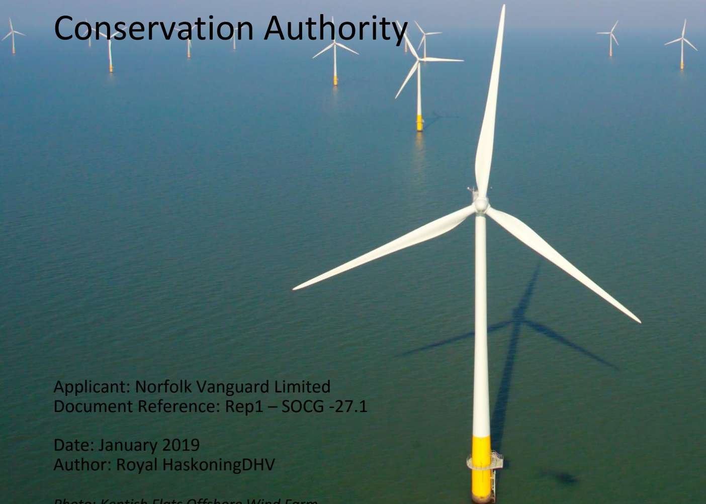
Photo: Kentish Flats Offshore Wind Farm

Date: January 2019 Author: Royal HaskoningDHV